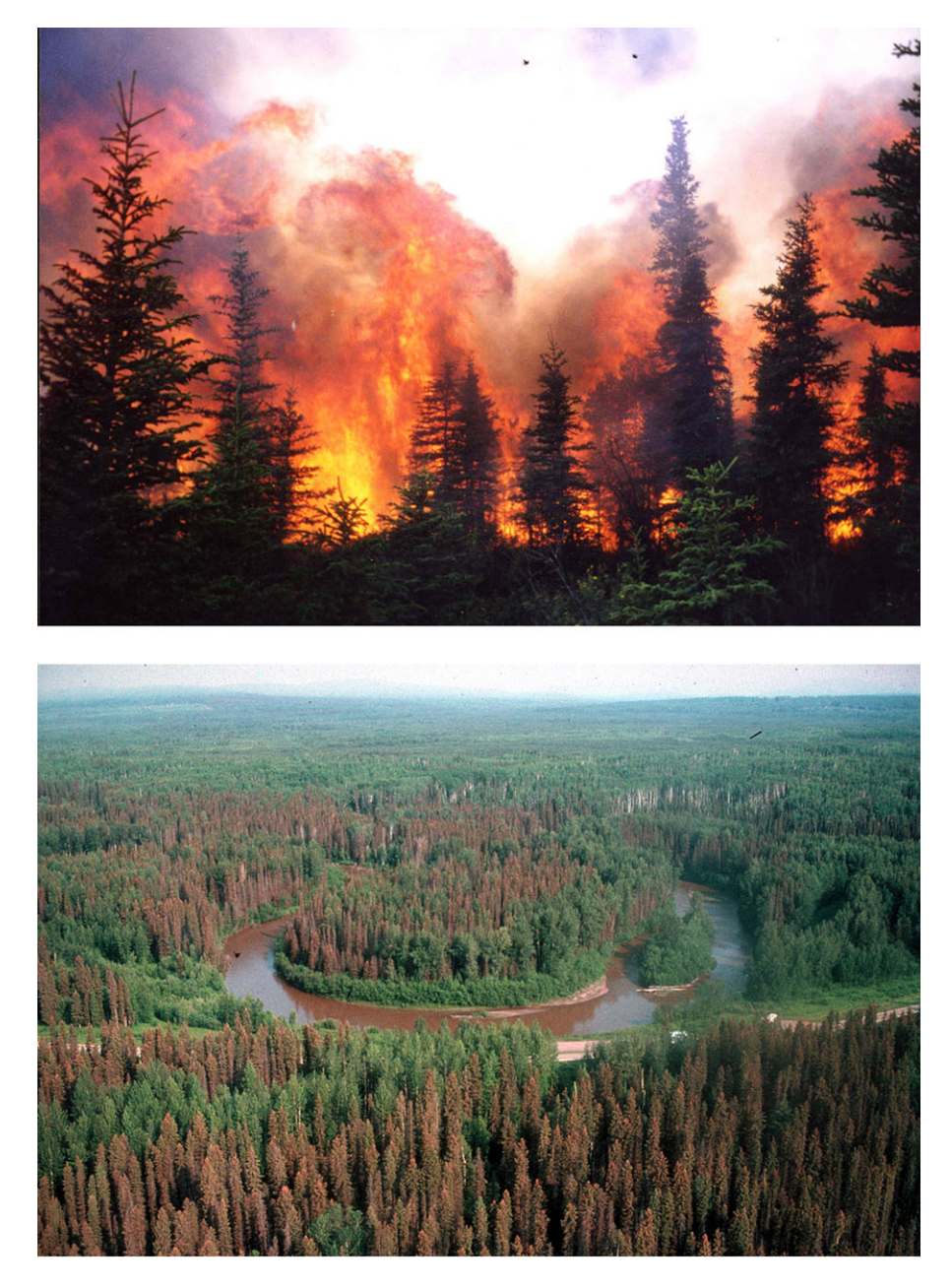
Figure 2 Top: Forest fire in Alaska. Bottom: Spruce budworm ( Choristoneura fumiferana ) attack on white spruce forest ( Picea glauca ) of northern British Columbia.

Abbott 2011), likely leading both to areas of increasing wetness that become methane sources (Zhuang et al. 2007) and to dry areas that are more prone to wildfire and insect outbreaks (Kasischke et al. 2010). There has also been an increased harvest of boreal forests to provide timber products (Potapov et al. 2011), as well as supporting an expanded use of forest biomass as a substitute to mitigate the impact of burning more energy-intensive fossils fuels (Poudel et al. 2012).